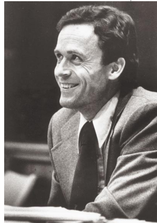
Figure 1 Portrait of a serial killer: psychopathic murderers such as Ted Bundy can often project a deceptively charming persona.

To our knowledge, this is the first cognitive demonstration of abnormal social beliefs in murderous psychopaths. The interaction between psychopathy and murder suggests that it is the combination of these two factors